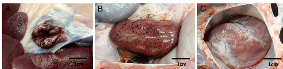
Figure 1 Macroscopic lesions observed in organs of domestic pigs infected with the Georgia 2007/1 ASFV strain. A) Enlarged and haemorrhagic hepatogastric lymph node from a between-pen contact pig terminated at 11 days post exposure. B) Multifocal cortical haemorrhages (petechiae) on kidney from an inoculated pig terminated at 8 days post-inoculation. C) Fluid in pericardial cavity (hydropericardium) from a within-pen contact pig terminated at 12 days post-exposure.

signs and virus shedding were compared per group using a t-test. The type of post-mortem lesions were compared between groups using a one-way ANOVA test. The values of clinical scores and viral shedding were compared between groups in relation to time using a linear mixed effect model. All statistical analyses and plots were performed using the R statistical program [20]. The packages “epi.studysize”, “lme4”, “lmerTest”, “latticeExtra” and p < 0.05 were used to indicate statistical significance.