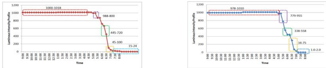
(a) Profile without Vehicle Parked