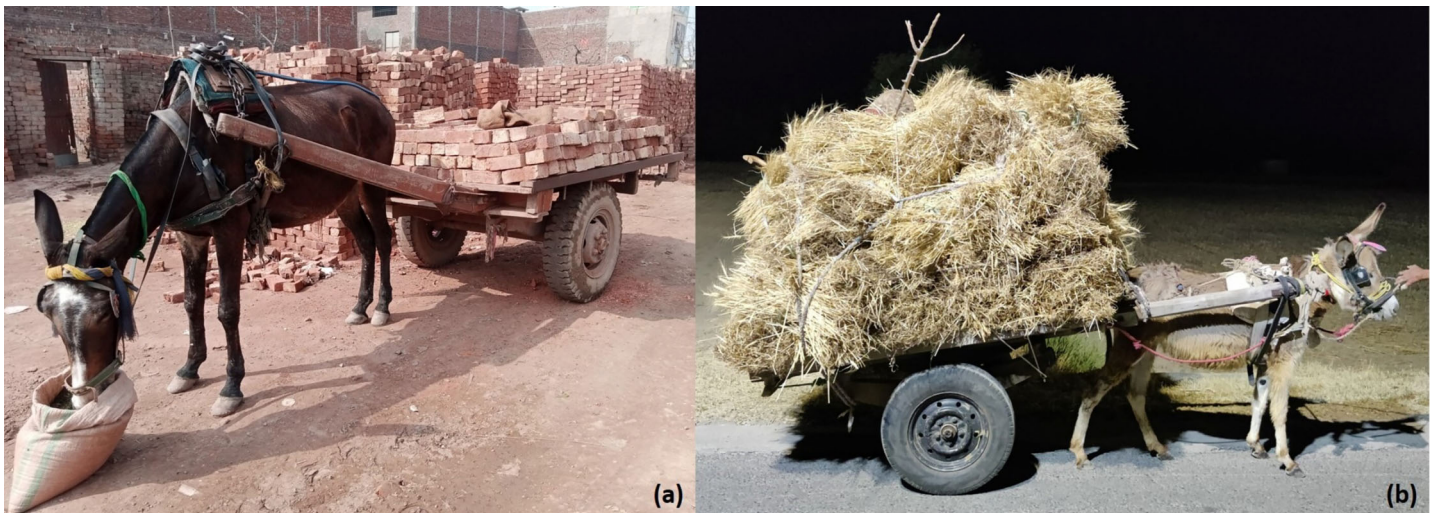
Figure 7 (A) Load-pulling mule at an urban brick kiln production system in Pakistan. (B) Donkey pulling wheat crop in the rural agricultural production system in Pakistan. Full-size DOI: 10.7717/peerj.17149/fig-7

Individual animal level welfare assessment usually comprises a visual inspection to evaluate camel behavior and health status. Some of the most important points to check while assessing individual camel welfare are body condition score, presence of disease, resting behavior, and injuries due to tethering and hobbles ( Padalino & Menchetti, 2021 ; Zappaterra et al., 2021 ). Moreover, camel feeding and drinking behavior should be examined. The good feeding and drinking principles are adequate nutrition and lack of prolonged thirst. Hunger and thirst can appear not only when feed and water are unavailable, but also when they are inaccessible or do not meet the behavioral and physiological needs of the animals ( Padalino & Menchetti, 2021 ).