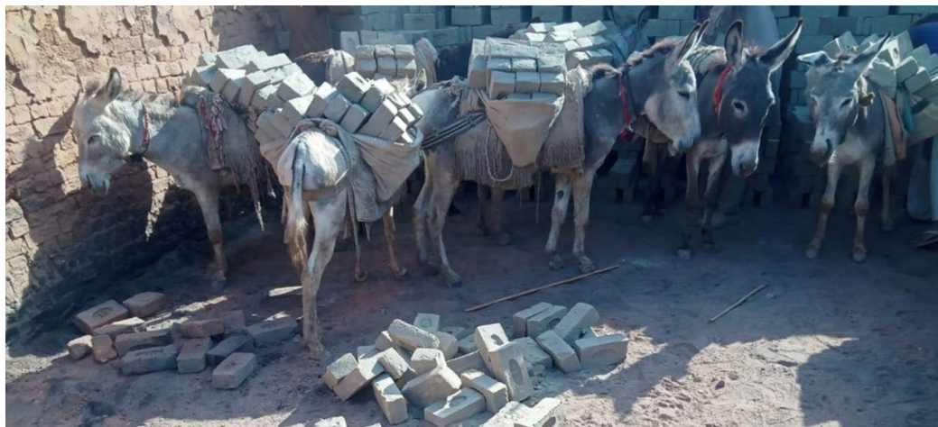
Figure 8 Donkeys carrying bricks in Pakistan.