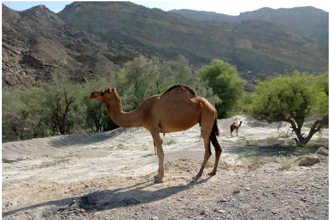
Figure 6 Dromedary camels farmed using an extensive nomadic production system for milk and meat in Balochistan-Pakistan.